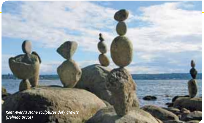
Kent Avery's stone sculptures defy gravity (Belinda Bruce)

Stone balancing is a vocation that calls only the most grounded of souls. "I have always loved